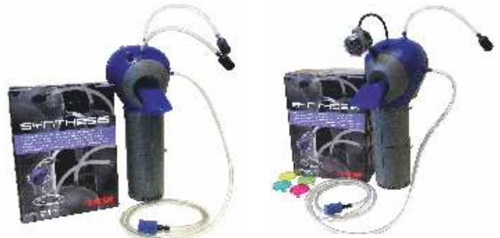
Synthesis - Shown with LED light fitted