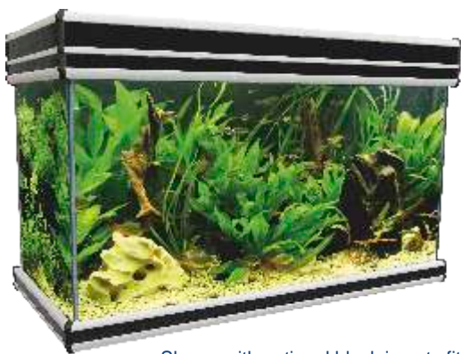
Shown with optional black inserts fitted