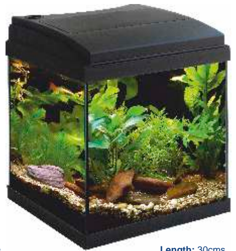
Length: 30cms Width: 29cms Height: 36cms Litres: 24L Glass Thickness: 4mm

An optional heater may be added to convert the aquarium making it suitable for tropical fish.