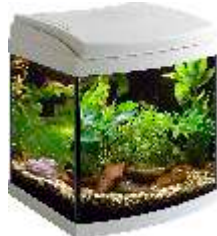
Aquaria 30 Curve