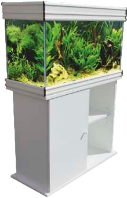
Shown with optional floor Cabinet.

Top of the range aquariums built using extruded aluminium for the frame and ultra-clear glass for superb finish. A unique feature of the tanks is a sliding and removable aluminium bar, complete with lighting. This makes it easy to adjust the lighting to your desired position in the tank and is also easy to access by the two lay flat lids. Optional floor standing cabinets are available to finish the look of your aquarium.