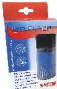
Bip - Filter Pump